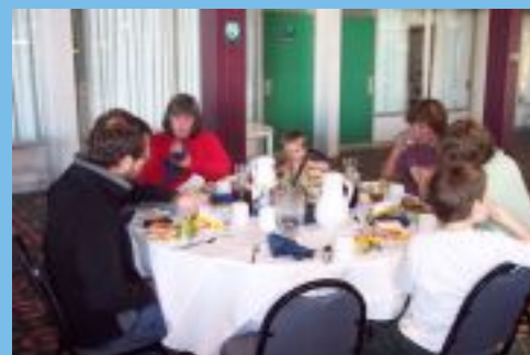
Due to the freezing cold weather, we enjoyed our "Lunch at the Lodge" poolside!