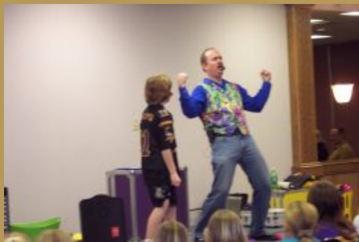
Can you do this? Would you do this????

Some were brave enough to share the stage!