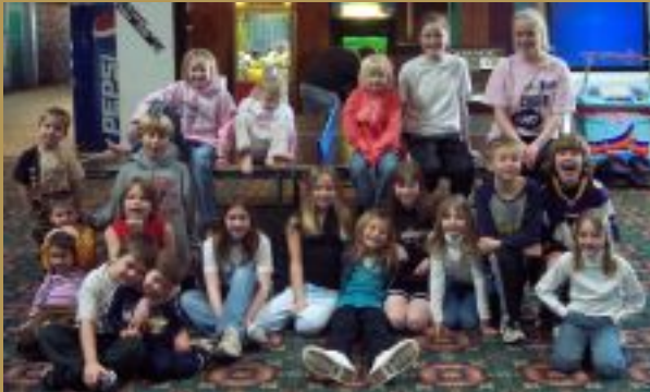
2007 SDAFP Winter Seminar

The SDAFP Winter Seminar had something for the whole family to enjoy!