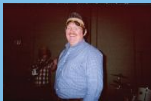
Ladies and gentlemen, ELVIS is in the house!

He is licensed in SD in the specialty of Family Medicine. He is currently employed at Avera St. Benedict Health Center. He has hospital privileges at Avera St. Benedict Health Center, Douglas County Memorial Hospital, Armour, SD, and Avera Queen of Peace, Mitchell, SD.