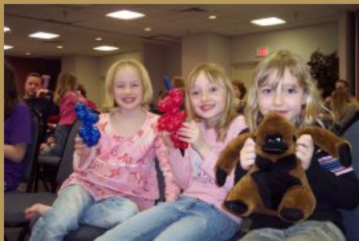
CUTE! CUTE! CUTE!