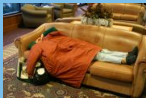
Who got caught napping?