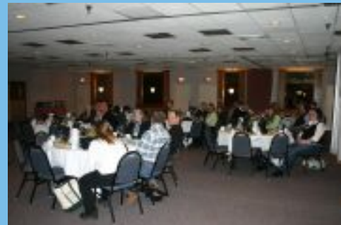
2007 President's Reception