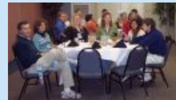
Students and Residents