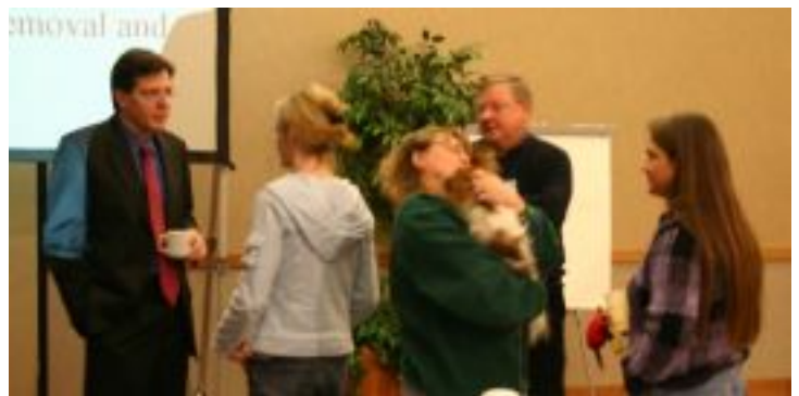
Some members stayed to ask questions.